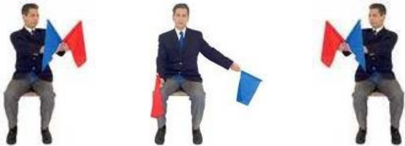
f. Three Judge Layout.